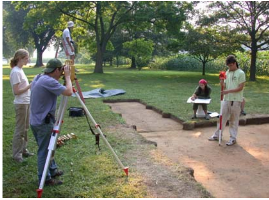
Students from the College of William and Mary carried out detailed mapping and feature excavations during the 2004 field season.