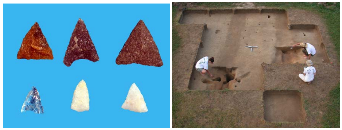
Artifacts found at Werowocomoco include quartz and jasper arrowheads (left); huge ditch features (dark linear soil stains pictured above) at Werowocomoco indicate that the site was divided spatially (right).