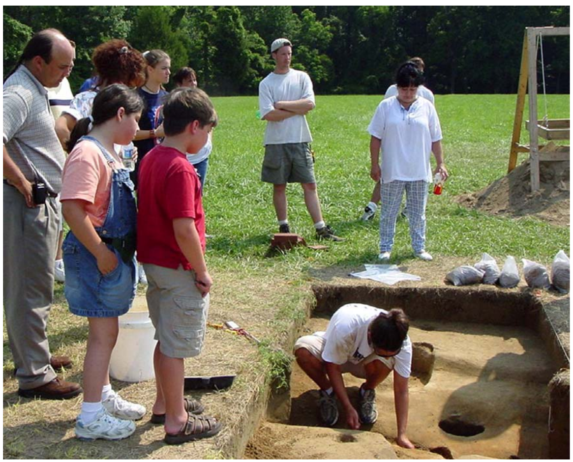
Parents and students from the Mattaponi Indian Reservation visit Werowocomoco during an educational tour.

For teachers, parents, and younger students of Werowocomoco, helping to better understand archaeology and appreciate the importance of Werowocomoco to Virginia and to the Nation: Grade School Werowocomoco (pronounced whero-wo-co-MO-co).