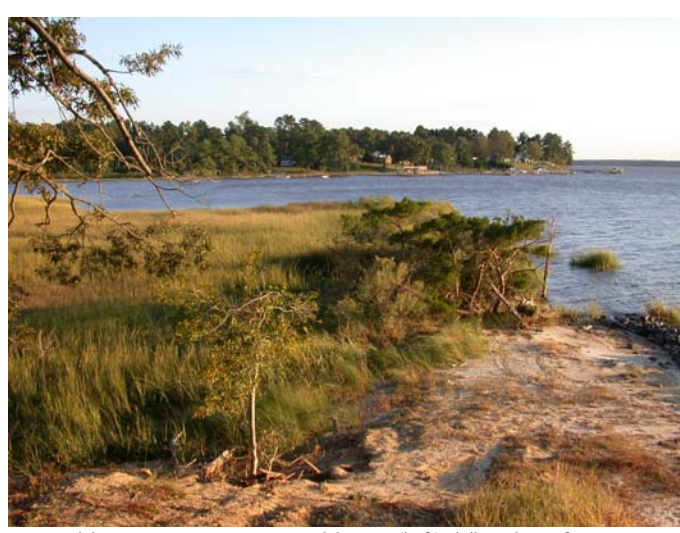
A seventeenth-century engraving of Powhatan at his Werowocomoco residence (left); The site of Werowocomoco, in 2004, overlooking Purtan Bay in Gloucester County, Virginia (right).

Rising from the forest floor and the York River's edge, the powerful community of Werowocomoco once flourished in what is now Gloucester County, Virginia. Werowocomoco (site 44GL32) served as the capital of the Powhatan chiefdom that dominated most of coastal Virginia by the early seventeenth century and included perhaps 15,000 Algonquian-speaking Natives.