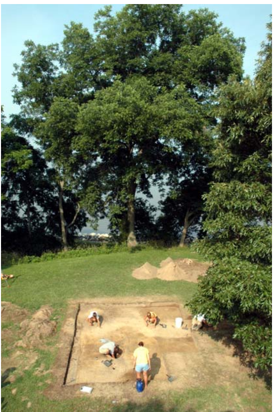
All soil removed during the excavations is carefully sifted through screens to recover even the tiniest of artifacts (left). By looking at large areas of site, patterns in the soil begin to emerge (right).